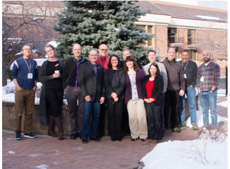
NSGIC Geo-Enabled Elections Steering Group

State representatives, in consultation with other members from their states, cast votes for official organization business.